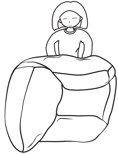
(Knock and Tap)