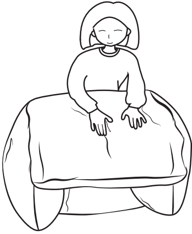
(Knock and Tap)