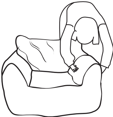
(Knock and Tap)