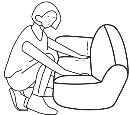
(Squeeze and Knead)