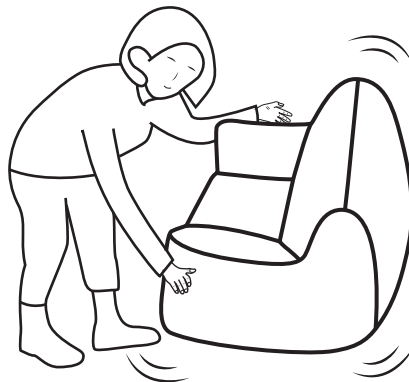
(Shake and Fluff)