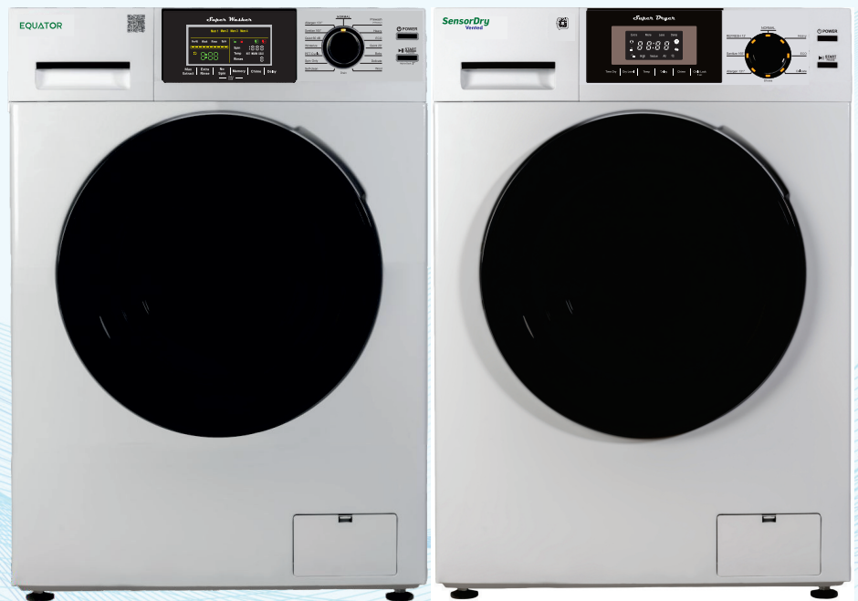
Side by Side