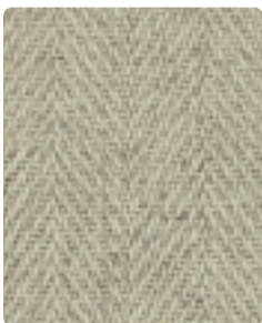
VD01 - BEIGE