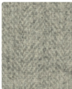
VD02 - GREY