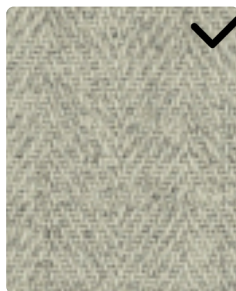
VD03 - SILVER