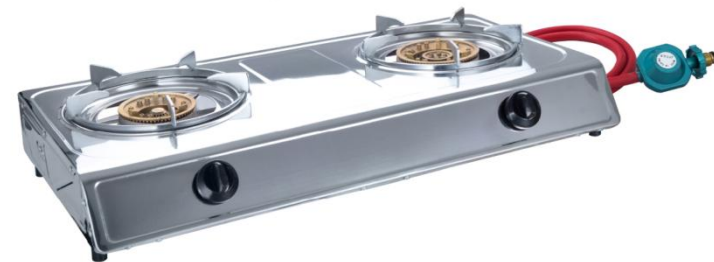
95501 Deluxe Stainless Steel Two Burner Stove