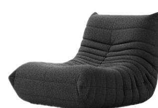
Bean Bag Chair