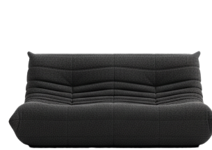
Loveseat Bean Bag Chair