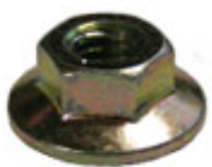
(4)- 7/16" Flange Nuts