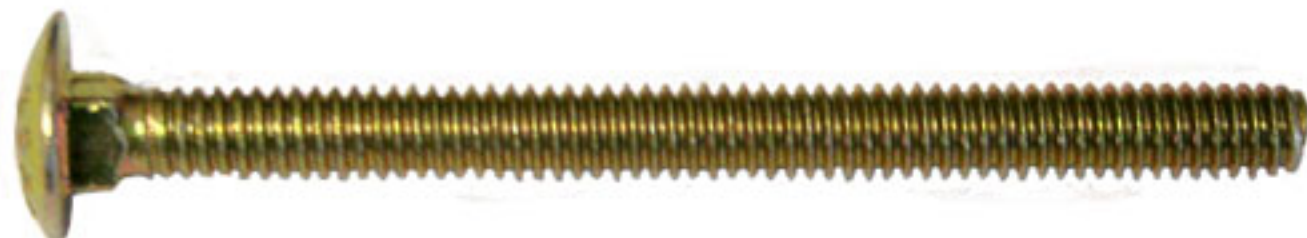
(4)- 3 1/4 x 1/4" Bolts