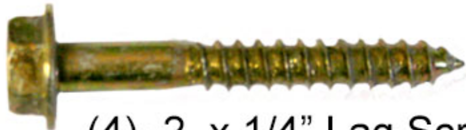
(4)- 2 x 1/4" Lag Screws