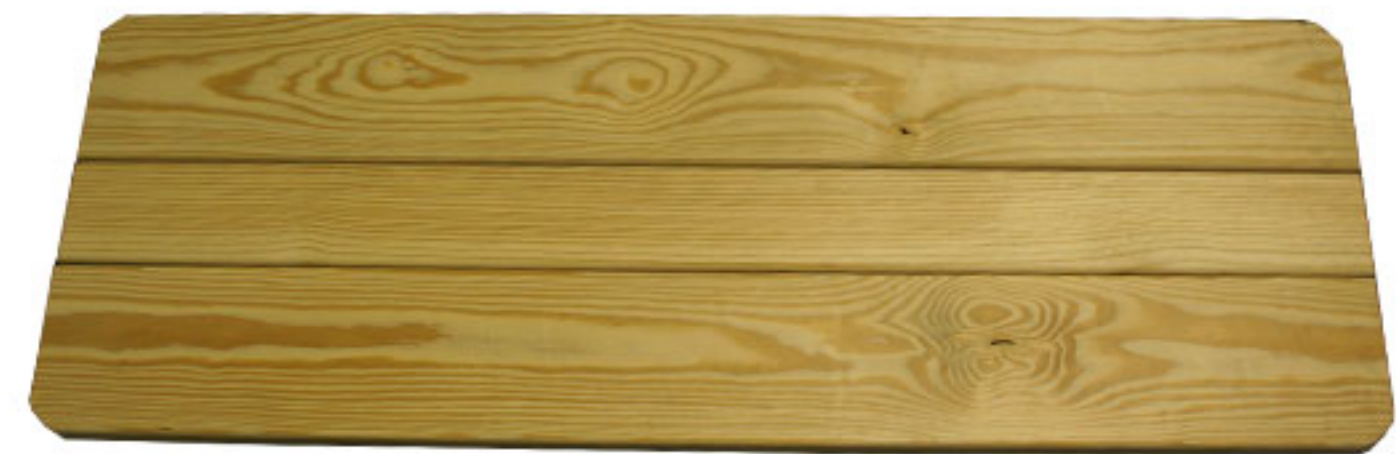
Bench Seat (1)