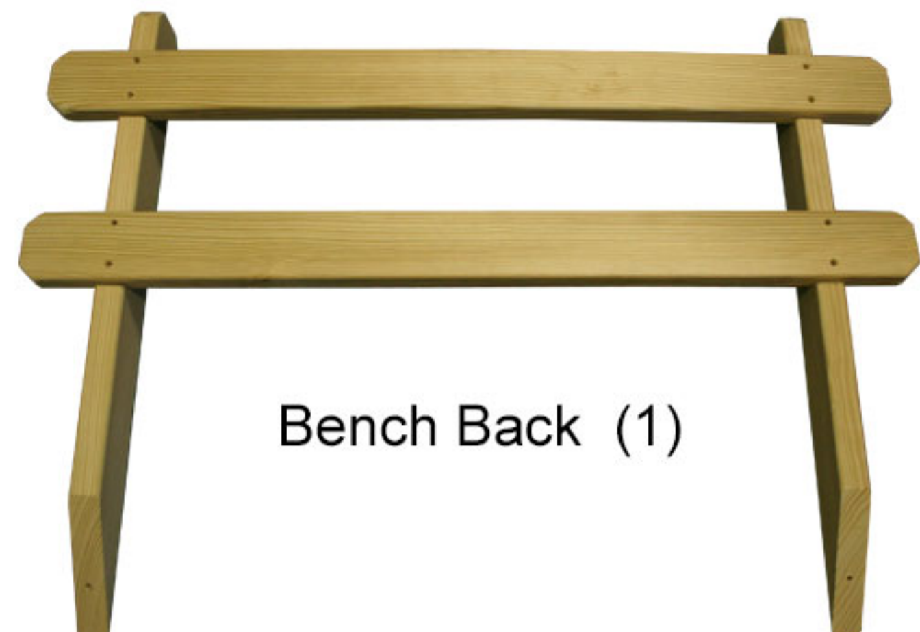
Bench Back (1)