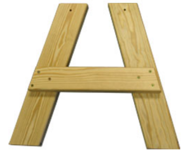
Leg Assembly (2)