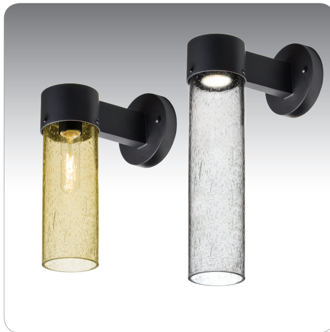
SHOWN IN GOLD BUBBLE) & SHOWN IN CLEAR BUBBLE WITH LED OPTION

UL or ETL Listed. Suitable for Wet Locations (interior or exterior use).