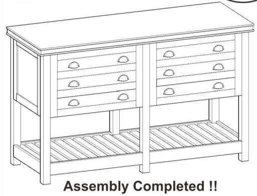
Assembly Completed !!