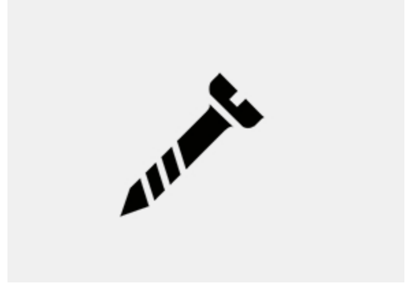
Small screw × 4