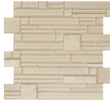
Life 12"x12" Mesh Mosaic W80ENTILI1212MO