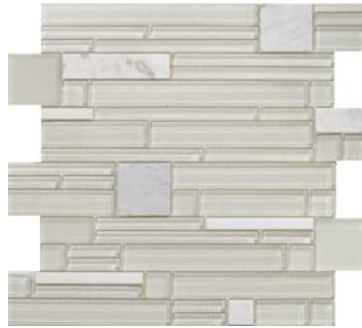
Gusto 12"x12" Mesh Mosaic W80ENTIGU1212MO