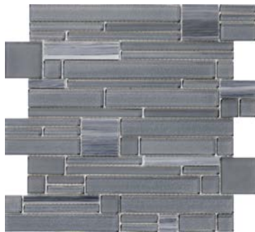
Zest 12"x12" Mesh Mosaic W80ENTIZE1212MO