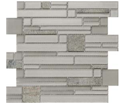
Spirit 12"x12" Mesh Mosaic W80ENTISP1212MO