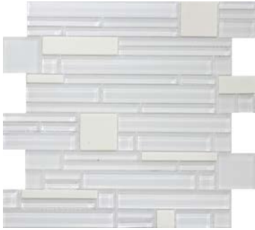
Energy 12"x12" Mesh Mosaic W80ENTIEN1212MO