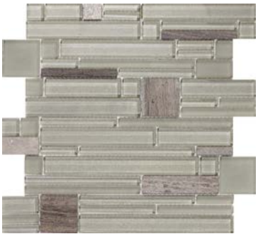
Vigor 12"x12" Mesh Mosaic W80ENTIV1212MO