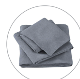
Soft dry cloth