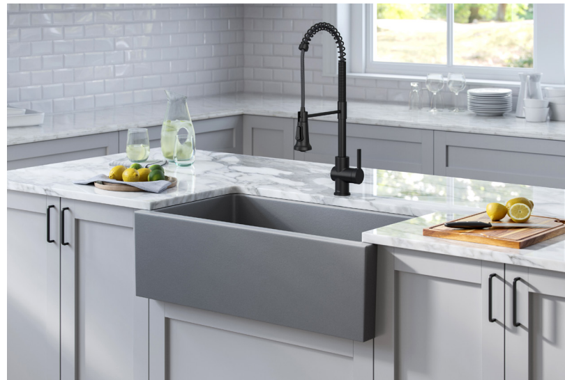
Turino™ 33” Fireclay Farmhouse Kitchen Sink (KFR1-33MGR)