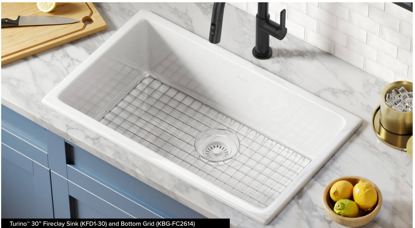
Turino™ 30" Fireclay Sink (KFD1-30) and Bottom Grid (KBG-FC2614)