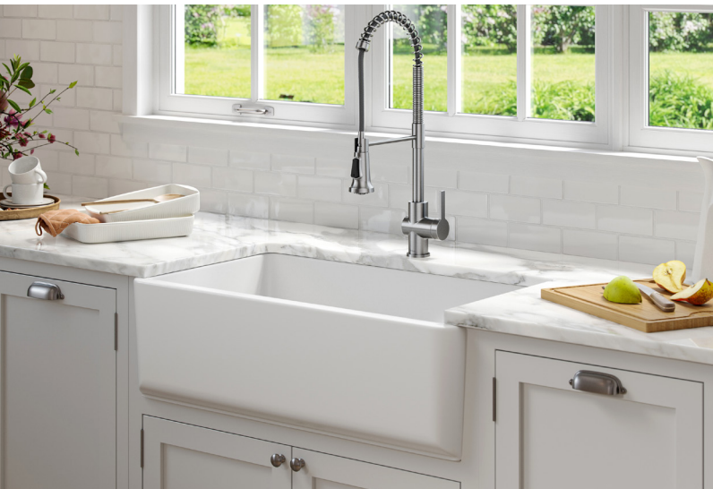
Turino™ 33” Fireclay Farmhouse Kitchen Sink (KFR1-33MWH)