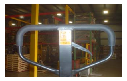
Drive - Neutral position lever in the center (as shown in the photo)

Raise - lever down (as shown in the photo)