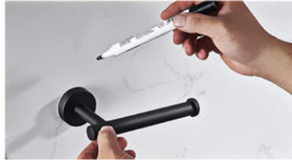
2 Measuring The Location