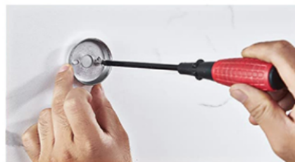
5 Put The Base Plate Over The Anchor