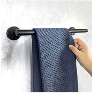
16 Inches Towel Bar