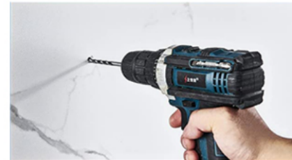
3 Drill The Holes