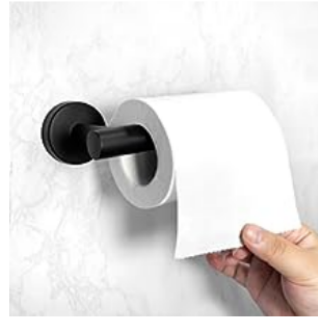
Toilet paper holder