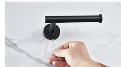
6 Using A Hex Wrench To Tighten The Screw