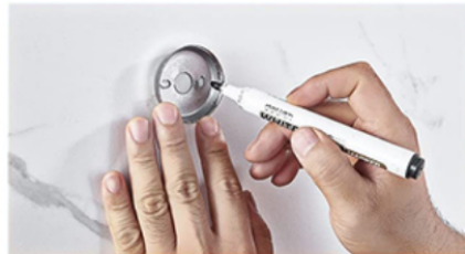
1 Mark With A Pen