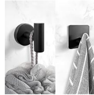
Towel Hooks/Coat Hooks