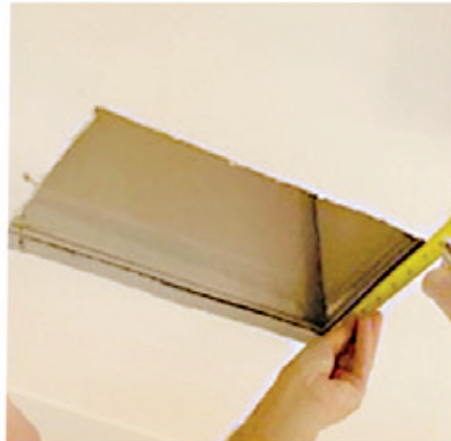
Measure opening to the closest inch.