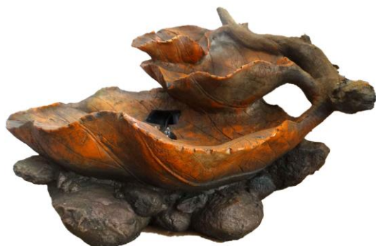
Fountain (Pump & LED lights pre-installed) 1x