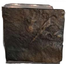
Fountain Back Door 1x