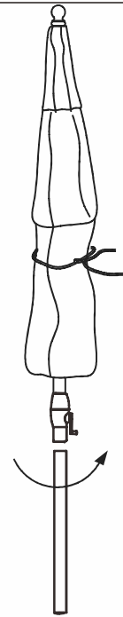
Fig.2: Insert bottom pole into canopy/mainframe pole and turn in tightly Then securely fasten your umbrella into umbrella base