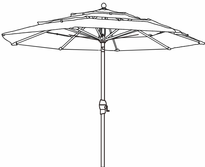
Fig.3: Turn the umbrella upright and crank handle clockwise to open umbrella to its fully open position. To tilt, press the button on the tilt connector to desired position.