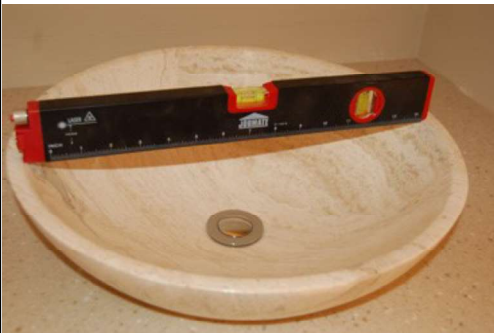
Above: Process for "Recessed Mounting"