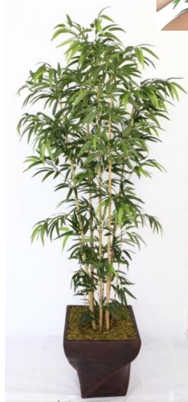
Finished Bamboo Tree