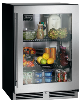
Glass Door Model (Indoor)

HC24RB-3 24" INDOOR MODEL HC24RO-3 24" OUTDOOR MODEL