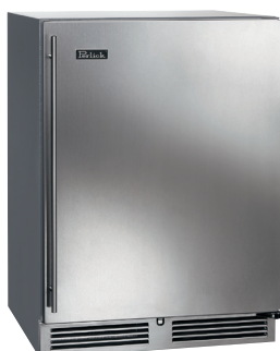
Solid Door Model (Outdoor)