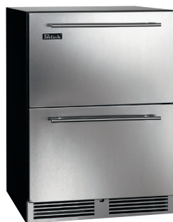
Drawer Model (Indoor)