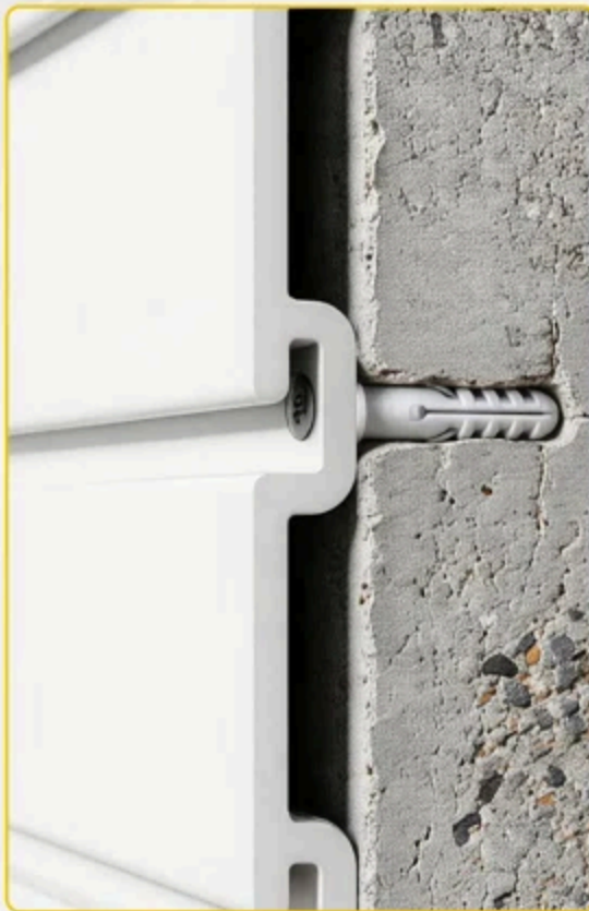
OPTIONAL 1 : BRICK/CONCRETE