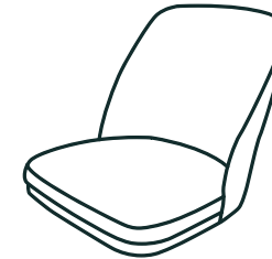
Chair Seat* 1