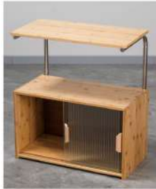
17. Turn the cabinet over.