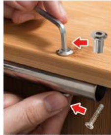
15. Mount the bracket and cabinet with a combination of round screws.