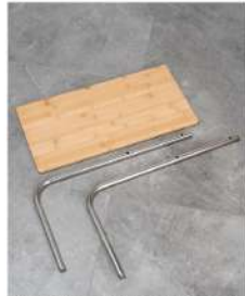
12. Take out the bracket laminate and bracket.