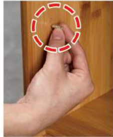
18. Insert plugs.