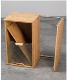
16. Bracket installation is complete.