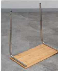
14. Install the left bracket with pointed screws.