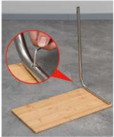
13. Install the left bracket with pointed screws.