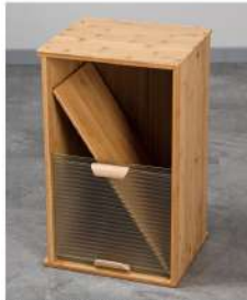
11. Install the side panel with long screws.