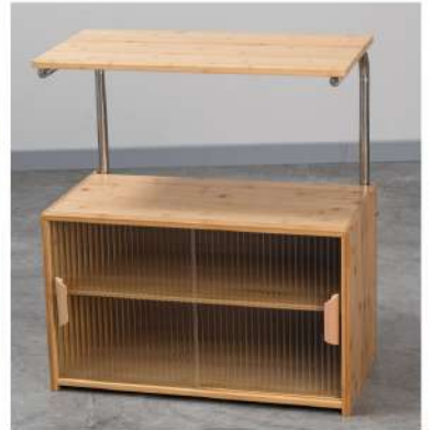
20. Installation is complete.