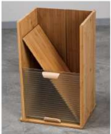
10. Insert another door panel (note the orientation of the door panel)