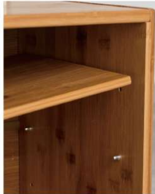
19. Place the baffle plate from step 8 on the plugs.