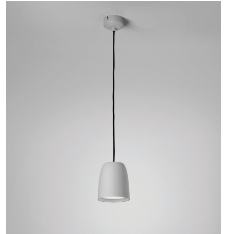
Image does not show north American canopy La fotografía no muestra el florón para Norteamérica