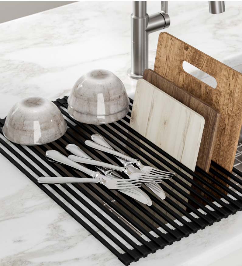
Multipurpose Over-Sink Roll-Up Dish Drying Rack (KRM-10)