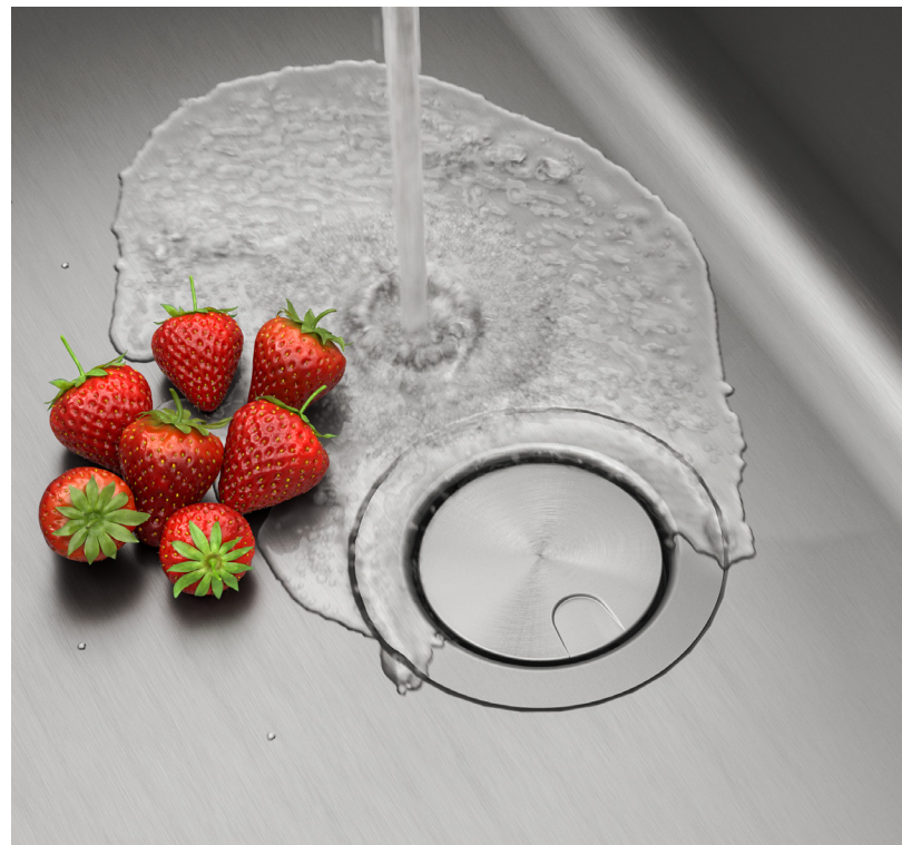
Stainless Steel Drain Assembly with Strainer (ST-4)