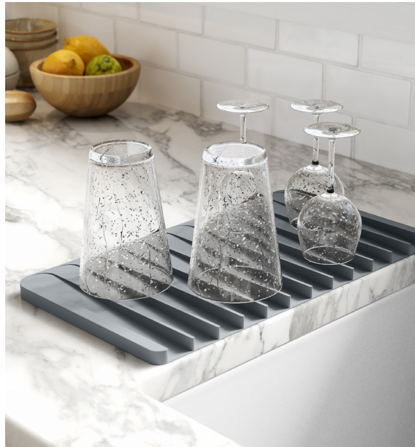
Self-Draining Silicone Dish Drying Mat (KDM-10)