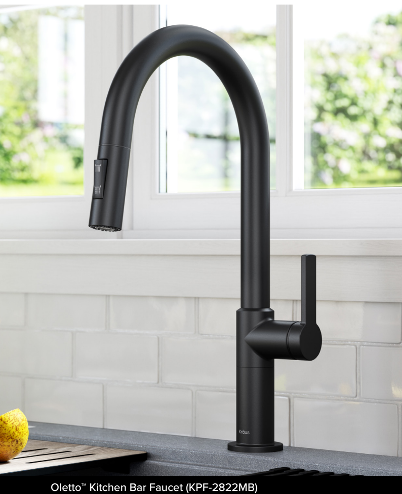
Oletto™ Kitchen Bar Faucet (KPF-2822MB)