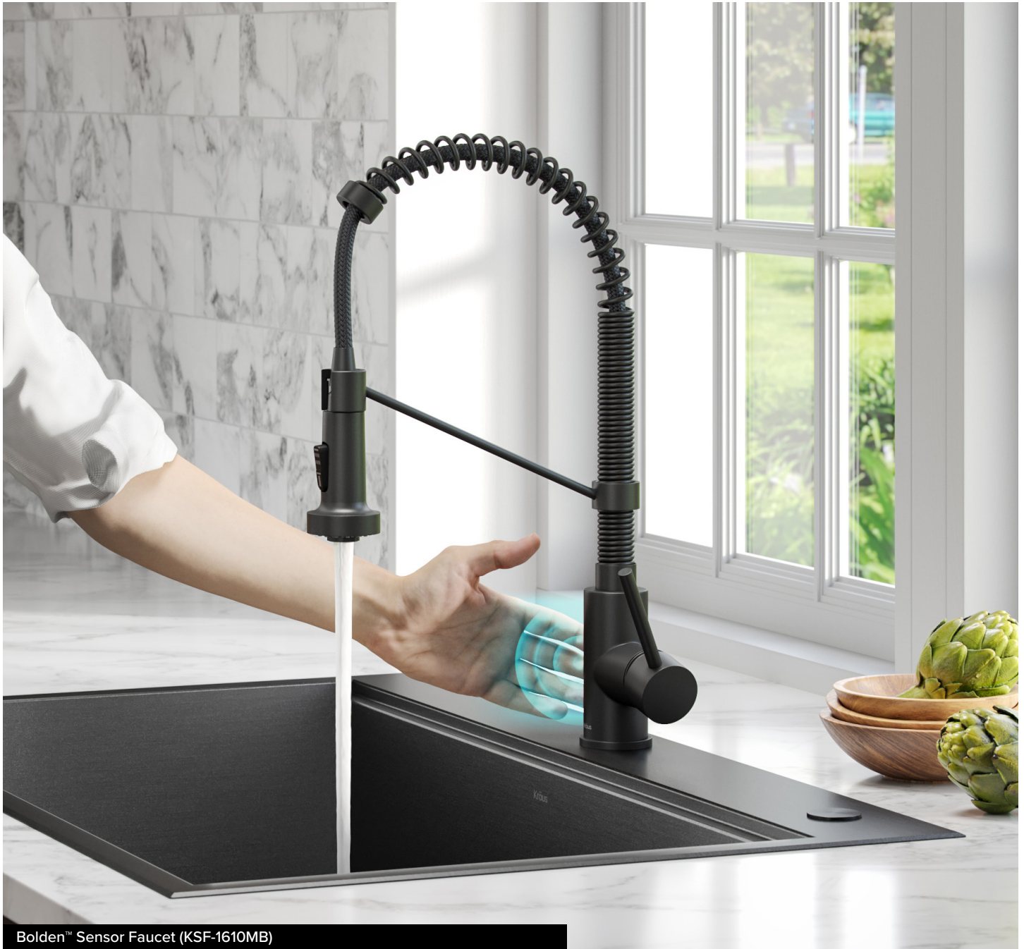
Bolden™ Sensor Faucet (KSF-1610MB)

Kraus Sensor Faucets are designed with hands-free capabilities, so they stay cleaner longer, with fewer spots and finger smudges over time. To clean and maintain your sensor faucet, simply follow the care instructions for Kraus Kitchen Faucets (Spot-Free Finishes or All Other Finishes), and enjoy the added benefit of ultra-clean hands-free functionality.