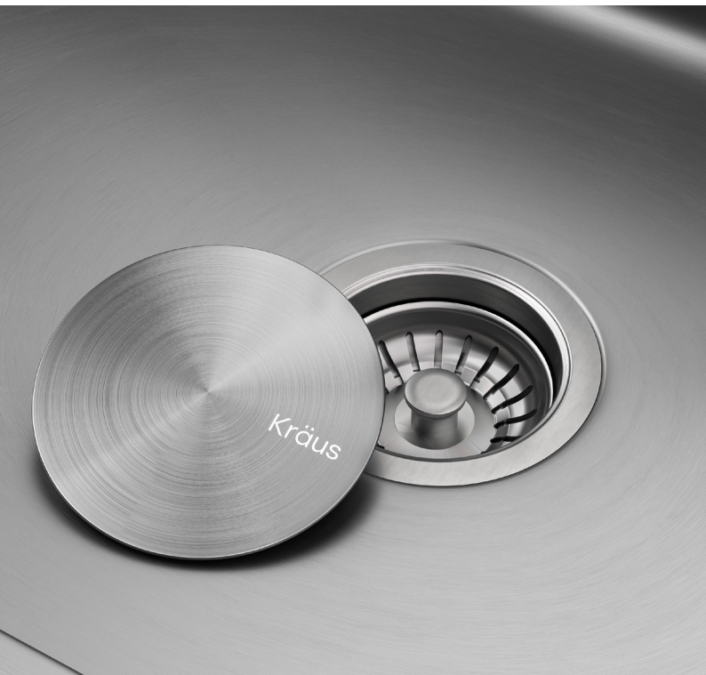
CapPro™ Removable Decorative Drain Cover (STC-2)