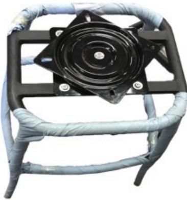
3. Put pressure on the plate and twist 45 degrees

If Swivel Plate has "Front Top" make sure this side facing the front of the stool If there is NO "Front Top" the plate can be attached in any direction