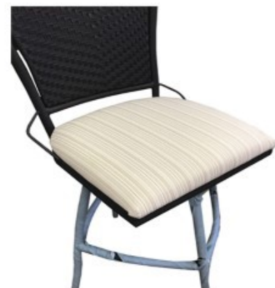
6. Place Seat on top of the bucket and 4 screws from the