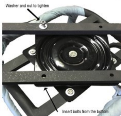
5. Insert bolts from the bottom of the top swivel plate and insert