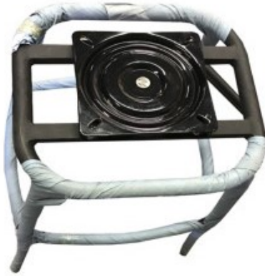
1. Remove Bar Stool from box.