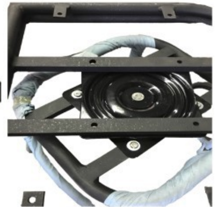
4. Place bucket on top of swivel plate.