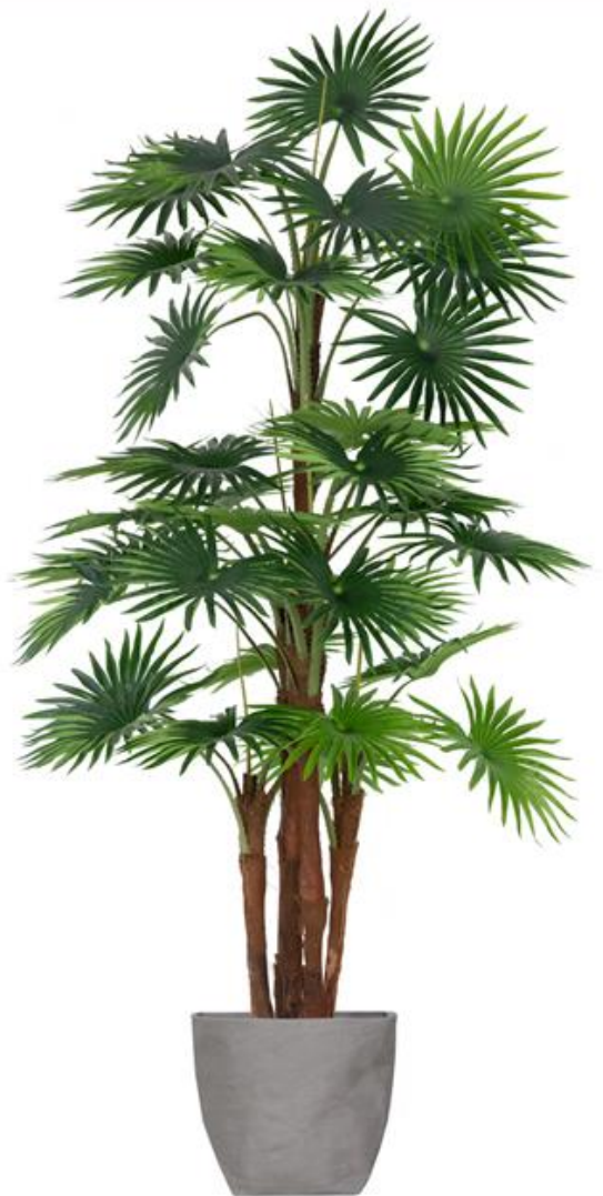
Finished Fan Palm Tree with Paper Eco Planter