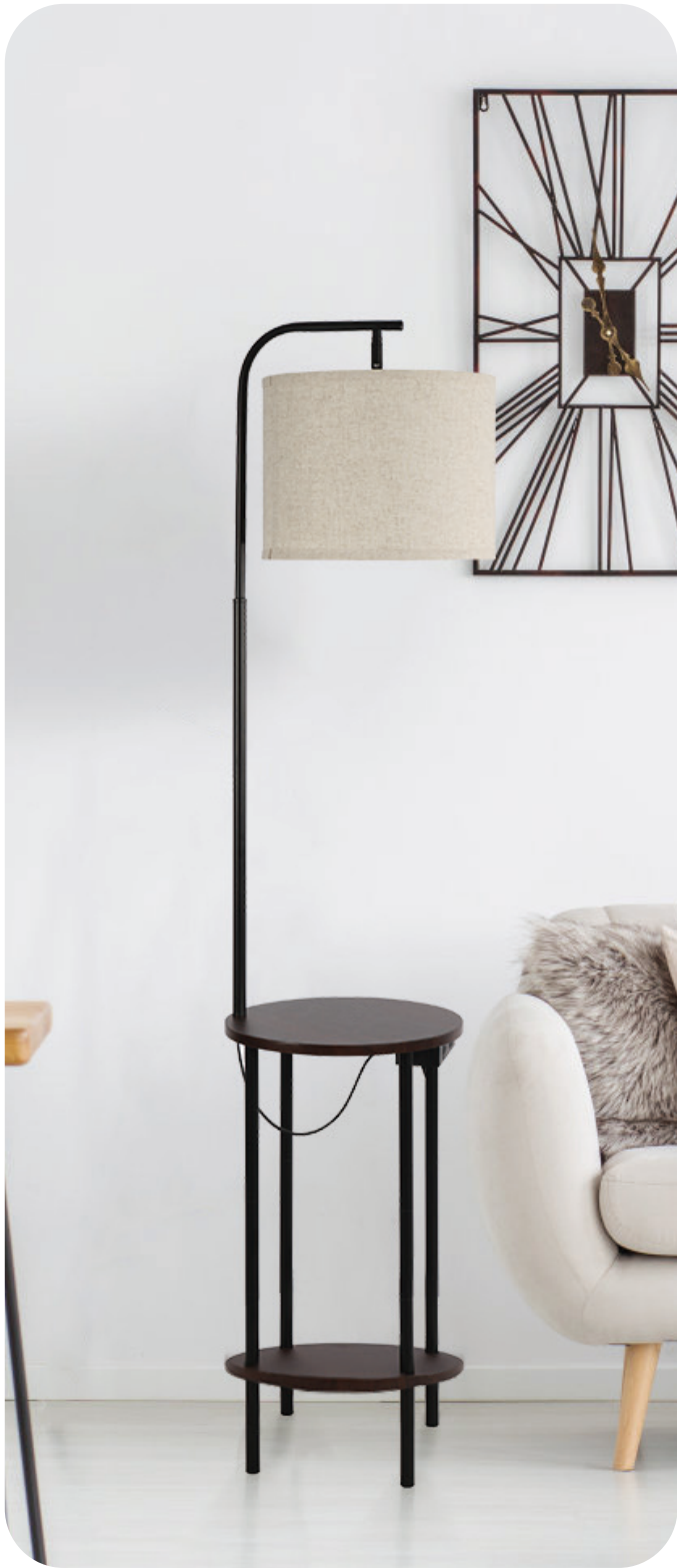
Table Floor Lamp USER MANUAL

Sincerely thank you for your business and support. I hope that the lamp you purchased is everything you expected, your satisfaction is my primary goal. If you have any questions or suggestions, please do not hesitate to contact me any time via email. If you would like to register for a 1-year warranty contact for extention warranty after you purchased within one month.