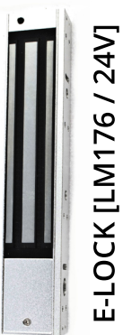
E-LOCK [LM176 / 24V]