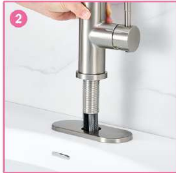
2. Insert all the hoses and the faucet into the sink hole.