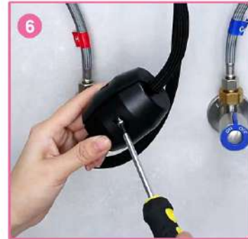
6. Clasp the weight to the "weight Here" label. The installation is complete.