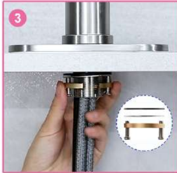
3. Put the rubber gasket, steel washer and the nut in sequence upward.