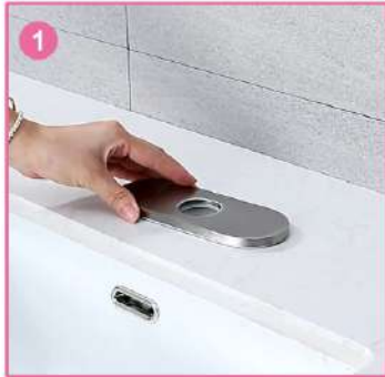
1. Put the cover on the table.

READ ALL INSTRUCTIONS STEPS BEFORE INSTALLATION. FLUSH ANGLE VALVE TO RELEASE ANY DEBRIS BEFORE INSTALLATION.