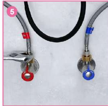
5. Install the other side of the inlet hose to the angle valve. (Just tighten it gently, excessive force will damage the hose)