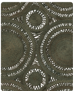
MH01 - OLIVE GREEN