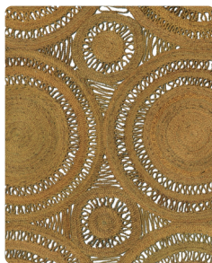
MH02 - GOLD