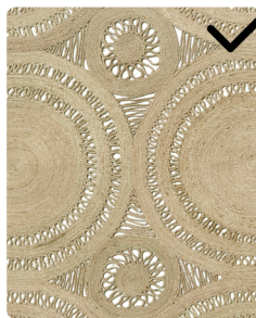
MH03 - BEIGE