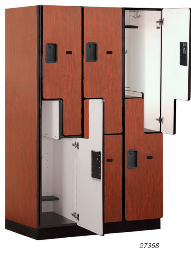
The double tier "S" style locker increases each compartment to 40-3/4" high on one side to accommodate garments. Each compartment includes a 5" deep shelf and a double prong ceiling hook