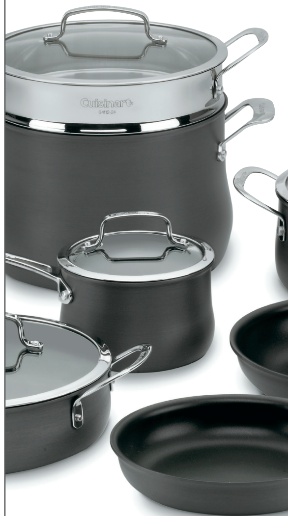
Cuisinart® Contour Hard Anodized Cookware