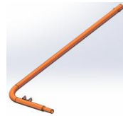
Handle lever 1*1