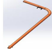
Handle lever 2*1