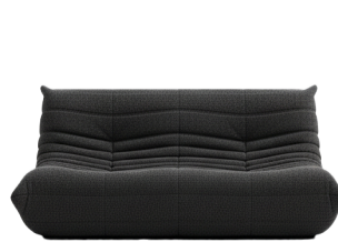
Loveseat Bean Bag Chair