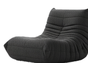
Bean Bag Chair