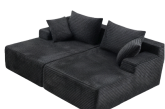
Loveseat Chaise Lounge