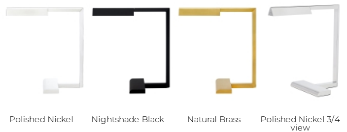
To view all available finish options, please visit techlighting.com