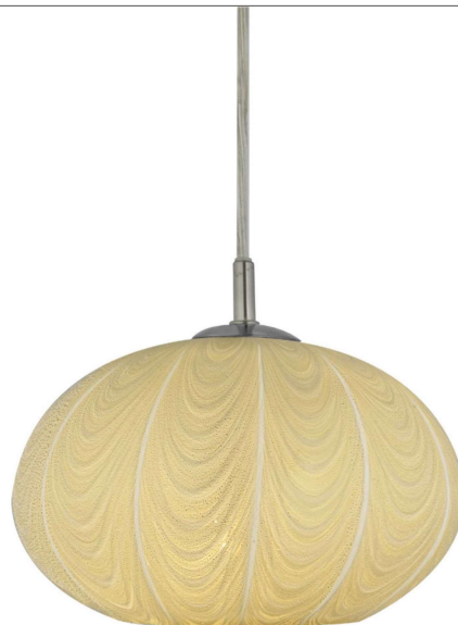
Shown with Feathers Shade with Satin Nickel Hardware

No two shades are exactly alike. There will always be variations, which are typical of a handmade product and contribute to its beauty.