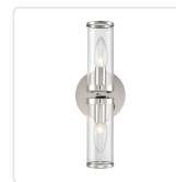
WV309002PNCG Clear Glass/Polished Nickel