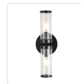
WV309002UBCG Clear Glass/Urban Bronze

*For complete warranty terms, please visit: www.aloralighting.com/warranty