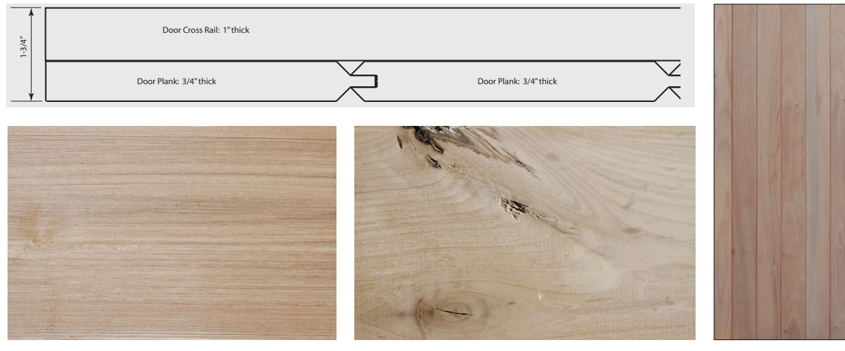
Barn Wood option

Comments: Multiple sizes available. Priced by the square foot.