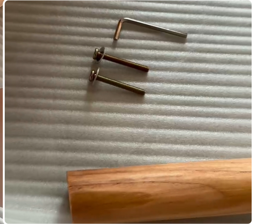
Parts and components

Align the legs with the holes at the bottom of the table with screws