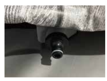
4.Garden hose adapter, which can connect your garden hose for convenient drainage. If using this adapter to fill water, it is necessary to open the drain plug at the bottom of the spa so that water can enter. After filling the water, press the water plug at the bottom tightly. Please use 1/4 soft hose.