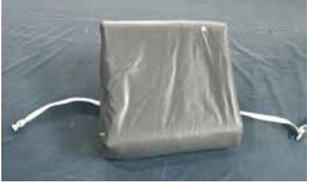
After using the spa, you can use a bandage to quickly store the pool to save space.