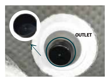
3.Before use, it is necessary to remove the black protective covers on the inlet and outlet respectively, otherwise the water will not heat up.