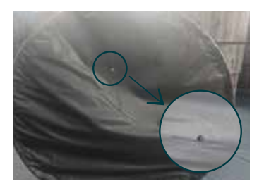
1.This circular hole is the exhaust hole at the bottom of the spa, which can prevent bottom bulging when the spa is filled with water.