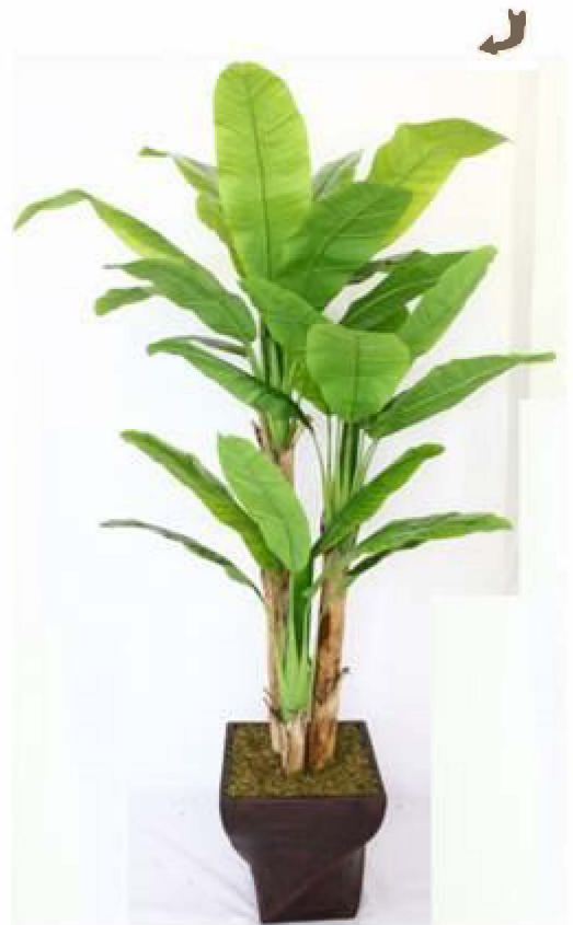
Finished Banana Tree