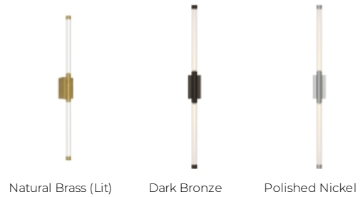
Natural Brass (Lit)

Includes 10.3 watt, 605 delivered lumens, 2700K LED module. Dimmable with most LED compatible ELV, TRIAC and 0-10V dimmers. Mounts vertically only. Up and downlight. 120V-277V.