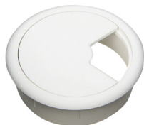
Cord Grommet Adjustable, White, Plastic, Size: 3-1/8"