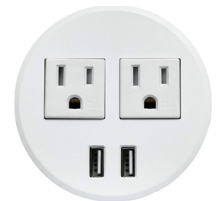
Two Power Outlets Two USB Charging Ports