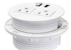
Power Output: 120V/12A, USB Ports: 5V/2A, 6ft Standard Power Cord for sockets.