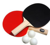
Ping Pong Set