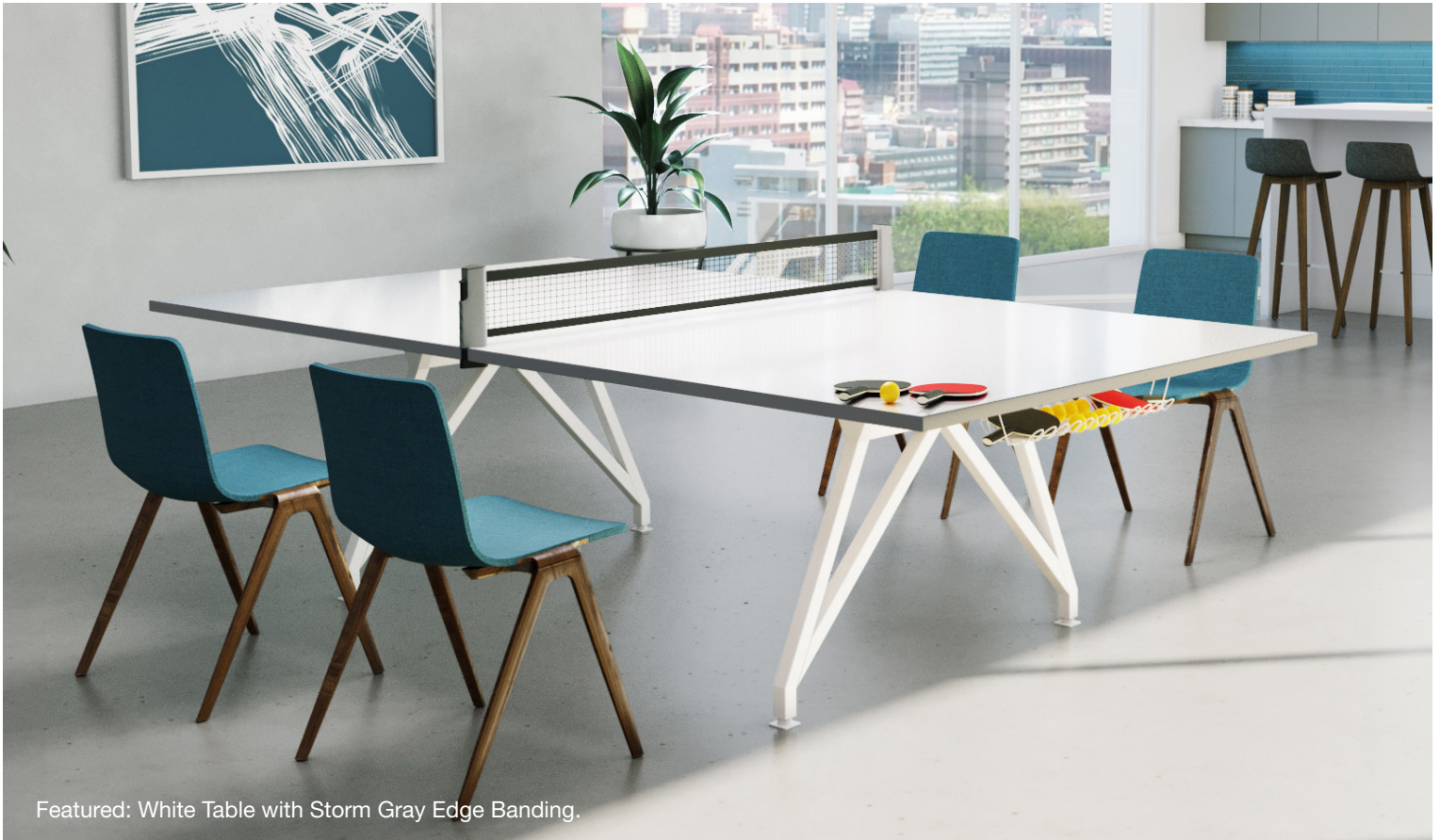
Featured: White Table with Storm Gray Edge Banding.