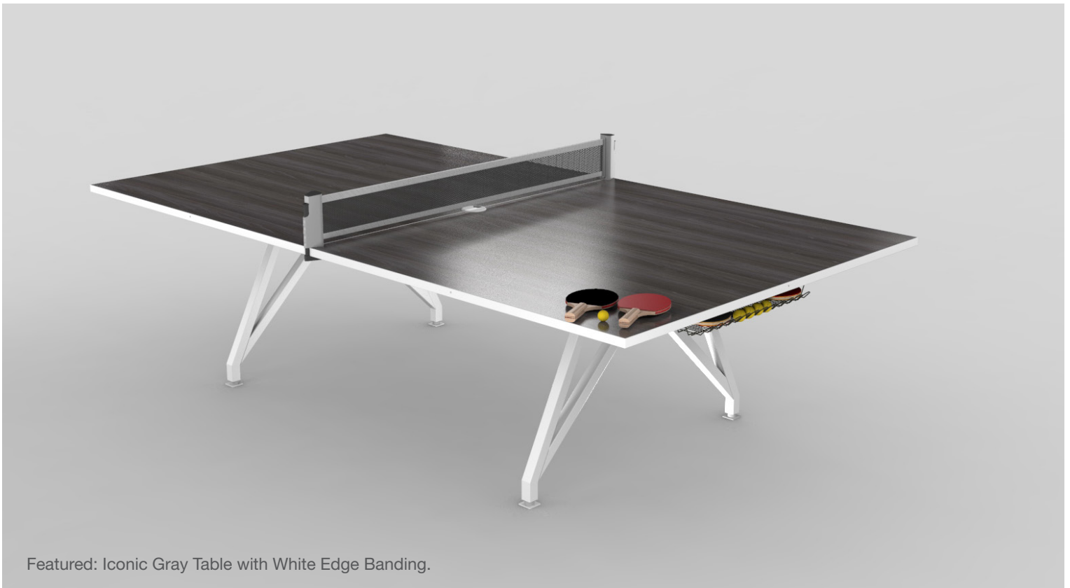
Featured: Iconic Gray Table with White Edge Banding.