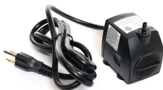
Fountain Pump 1x