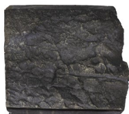
Fountain Back Door