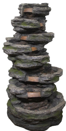
Fountain (3 LED lights pre-installed)