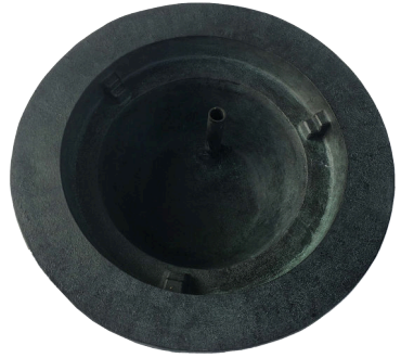
B. Fountain Bottom