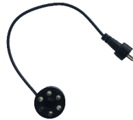
F. LED Lights