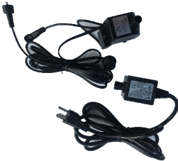
E. Auto Shut-Off Pump