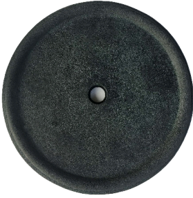
A. Fountain Top