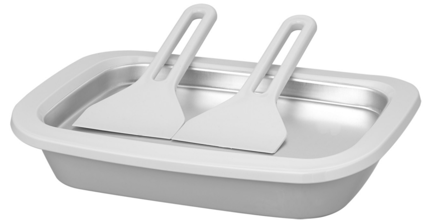
Classic Cuisine Instant Ice Cream Roller Plate