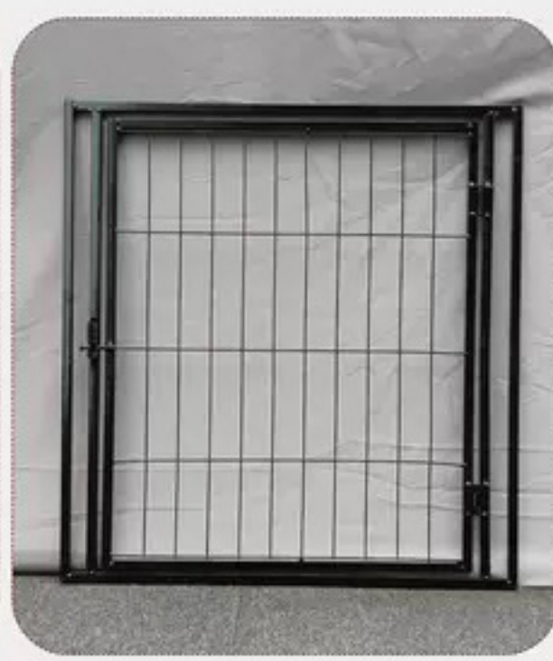
Frame with door