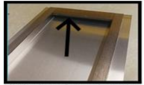
Lip for hanging over screw

For the single panel art, measure the distance between the first and second screw and repeat per number of desired screws.