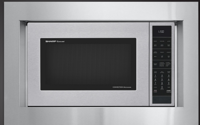
SMC1585KS Convection Microwave Oven with the RK94S30F Trim Kit

Includes Finish Trim, and Easy-to-Follow Instructions